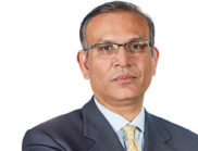
Shri Jayant Sinha

at Jacaranda Hall, India Habitat Center, Lodhi Road, New Delhi